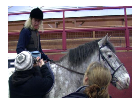
Fig. 1: The instructor, the tactile sign language interpreter, and the rider with DB during tactile signing.

This present study is concerned with instruction for movement in everyday situations and leisure activities. The particular context for studying instruction for movement is in the communication between a riding instructor and a rider with deafblindness (DB). The current method for communication is through an interpreter who translates instructions to tactile sign language directly in the hands of the rider (see Fig. 1).