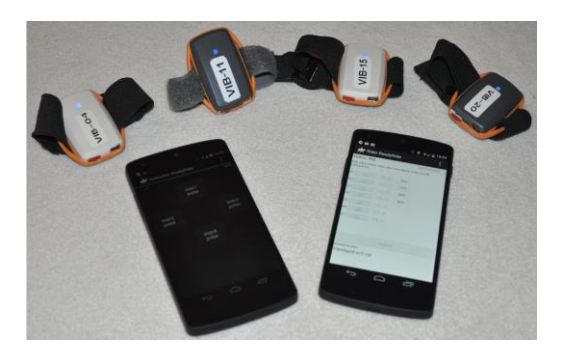
Fig. 2: Ready-Ride: two smart phones (sender and receiver) plus four vibrators in plastic holders.

"Ready-Ride" is a positioning and communication system designed to support autonomous horseback riding in a riding arena for persons with DB [7]. It consists of two smart phones (sender, receiver) and a number of vibrators.