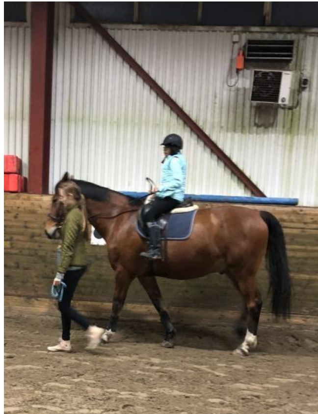
Figure 1: The assistant walking close to the rider with DB prepared to inform her about the instructions given by the instructor

Figure 2 shows the rider with DB receiving tactile instructions in her hand(s) via a sign