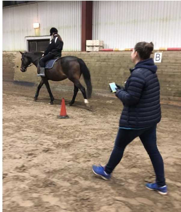
Figure 5: The user with deafblindness and her assistant guiding her from a distance using the Ready-Ride.