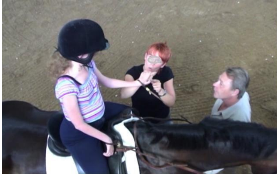
Figure 2: The rider with DB receiving tactile instructions in her hand(s) via a sign language interpreter.

Even riders with severe HI and D may have problems riding because they have difficult hearing the instructor, and cannot see the instructor's signs in all angles.